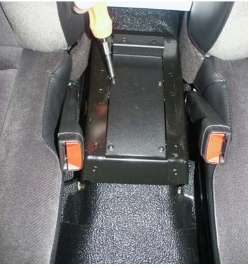
Attach rear extrusion bracket (CM001380) to vehicle using factory screws from, "partial console," removal.